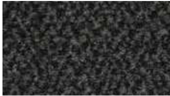
Slate Grey (GY)